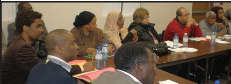
HCCI'S COMMUNITY MOBILIZATION TEAM DURING A TRAINING WORKSHOP